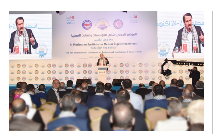
'International Conference of Professional Institutions & Trade Unions' Completed