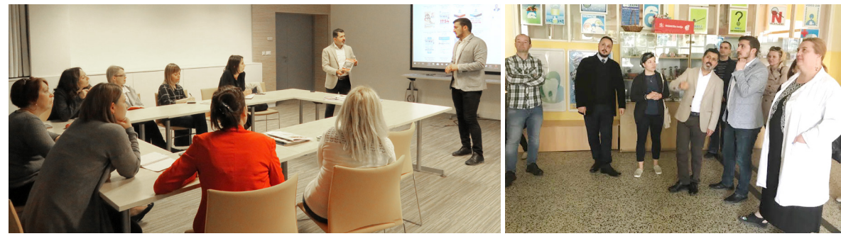
We Shared our Experiences in the Matter of