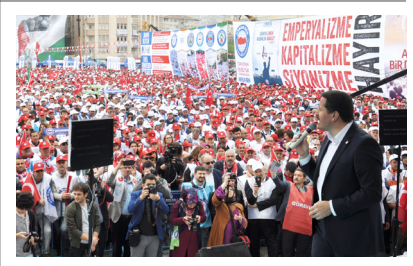
Thousands of People Gathered in Kocaeli to Celebrate May Day