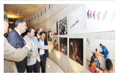
Eğitim-Bir-Sen Organized a Photography Contest Titled 'Frame from Education'