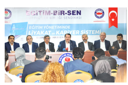
We Declared the Report on "Competence on Education Management and Career System"