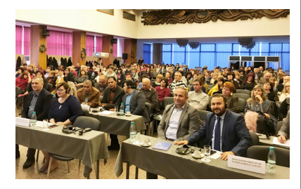
Yayla participated to the conference titled Humanism in Education