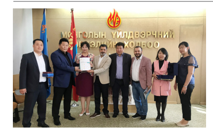
We shared our experiences with the Federation of Mongolian Education and Science Unions (FMESU)

We signed a bilateral cooperation agreement with the National Union of the Teaching Profession Malaysia (NUTP)